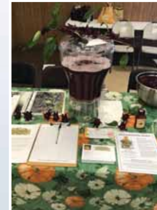
Delicious Sorrel Tea at Auro Community Garden's table