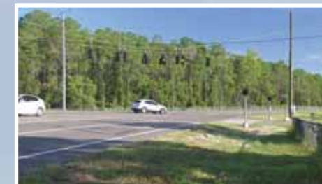
Street light at Crews Lake Middle School